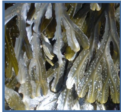
Serrated wrack Fucus serratus

Spirally twisted fronds with smooth edges and a prominent mid-rib. The twisted frond has no air bladders but may have reproductive bodies on tips. If the area you are in is dominated by this algae, you are too high on the shore