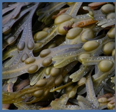
Bladder wrack Fucus vesiculosus

Flat fronds with air bladders in pairs either side of the distinct midrib. On more exposed shores, there may be less air bladders on the fronds and they may not always occur in pairs.