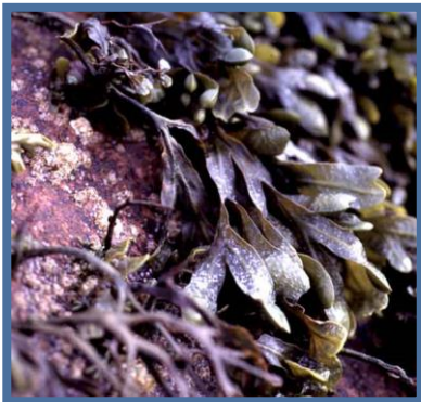
Spiral wrack Fucus spiralis

Spirally twisted fronds with smooth edges and a prominent mid-rib. The twisted frond has no air bladders but may have reproductive bodies on tips. If the area you are in is dominated by this algae, you are too high on the shore