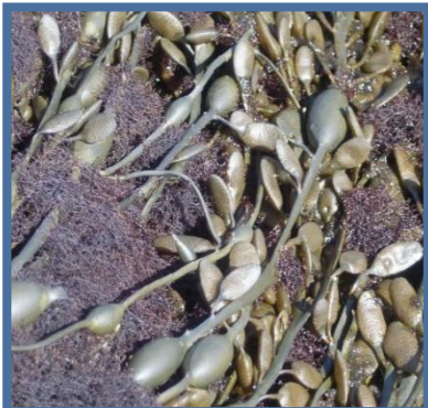
Egg wrack Ascophyllum nodosum

Flat fronds with teeth like serrations. Dichotomously branched with distinct midrib and no airbladders. If the area you are in is dominated by this algae, you are too low on the shore